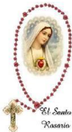
El Santo Rosario