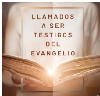
MEDITACIÓN DEL EVANGELIO – ALENTAR UN ENTENDIMIENTO MÁS PROFUNDO DE LA ESCRITURA (Gospel Meditations)